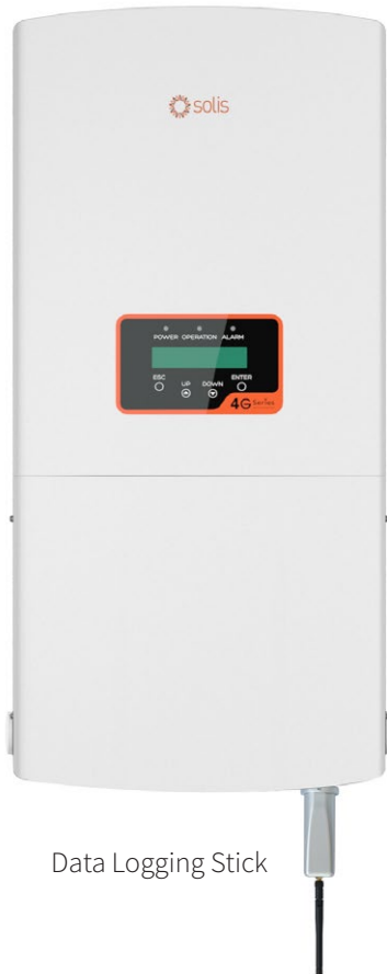
Data Logging Stick