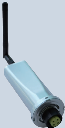
Data Logging Stick Wi-Fi