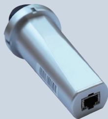
Data Logging Stick LAN